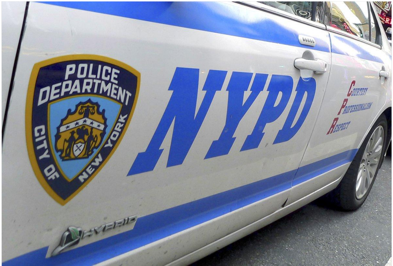
The city maintains that the NYPD does not use quotas. As part of the settlement, however, the department will send notices to all officers that quotas are banned.

The city maintains the NYPD does not use quotas. As part of the settlement, however, the department will send notices to all officers that quotas are banned and will be subject to investigations by the Internal Affairs Bureau.